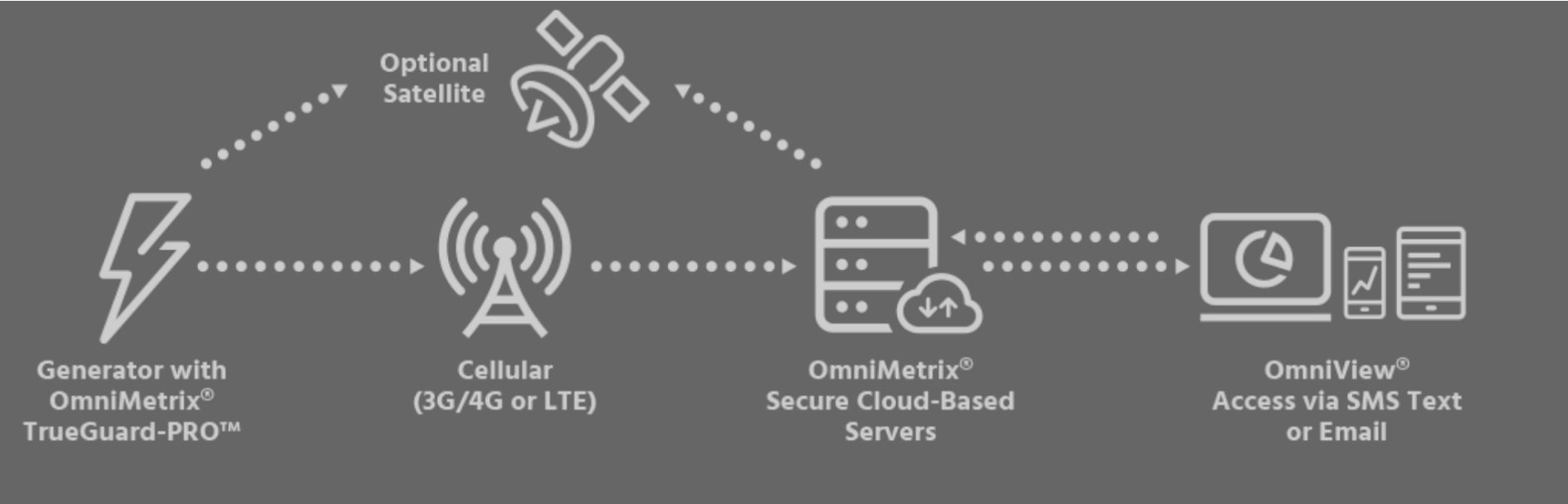
Illustration of Generator Monitoring